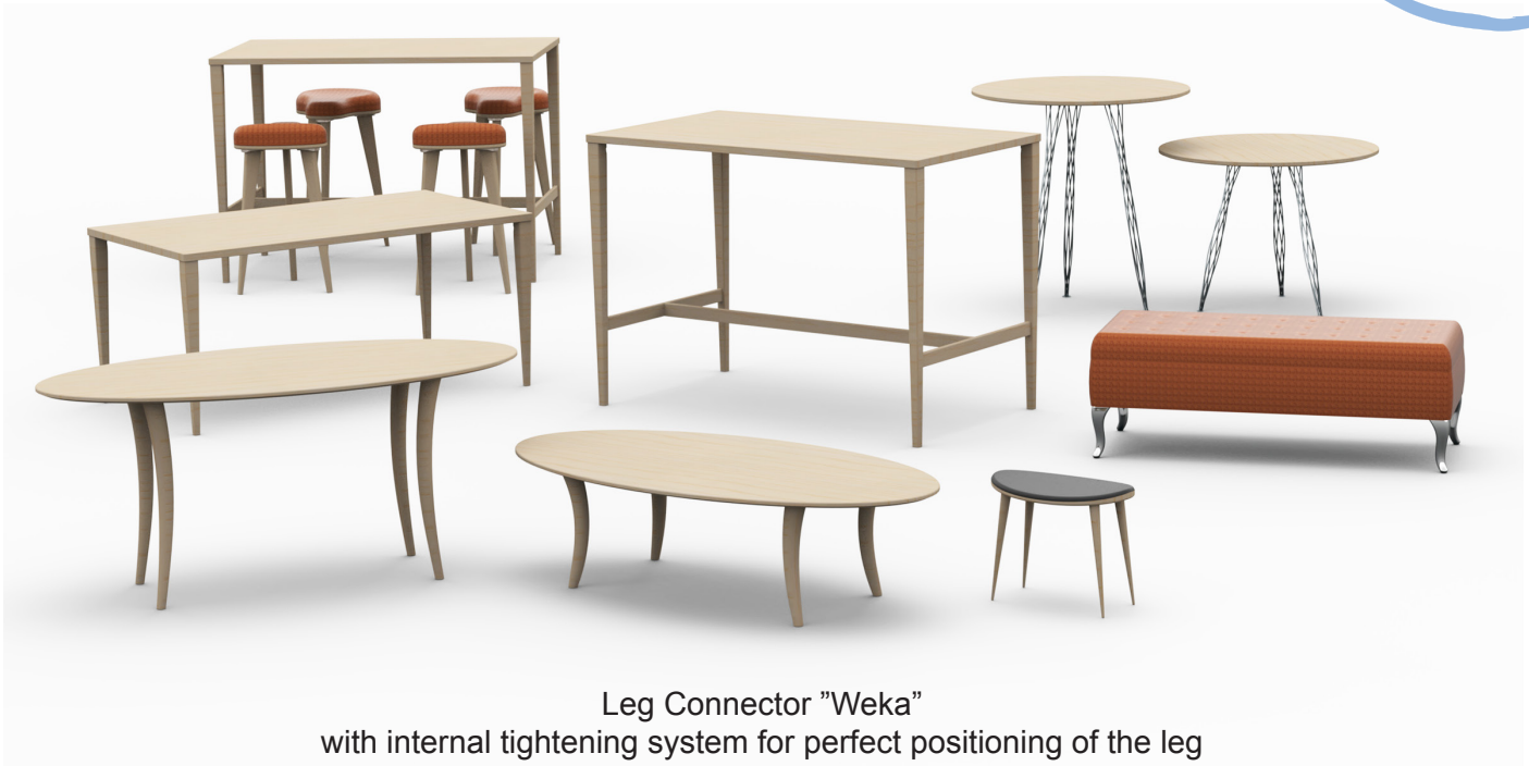
Leg Connector "Weka" with internal tightening system for perfect positioning of the leg